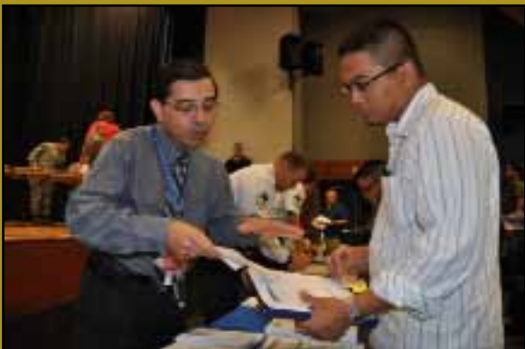
514th Air Mobility Wing honorary commanders partake in the Honorary Commanders oath at the induction ceremony held here. Local community leaders inducted as honorary commanders serve a one-year term working with base commanders to positively impact the community.