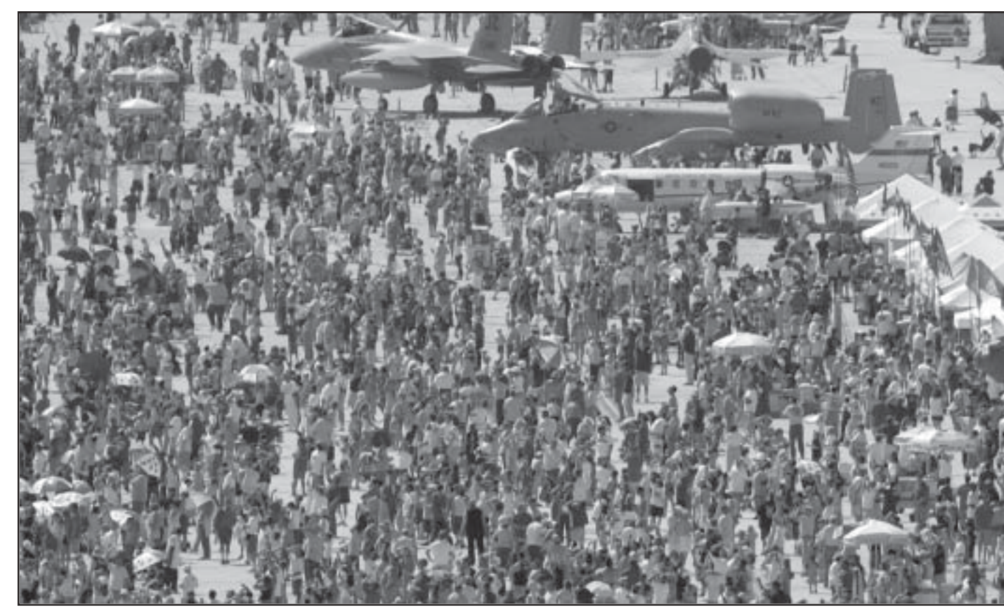
McGuire Air Force Base hosted more than 240,000 visitors June 4 and 5. Bright skies helped draw the large crowd for more than 47 aircraft statics, Marine, Navy, Army and Air Force recruiting stations, vendors and recreation attraction Sunday, showcasing civilian and military aircraft.