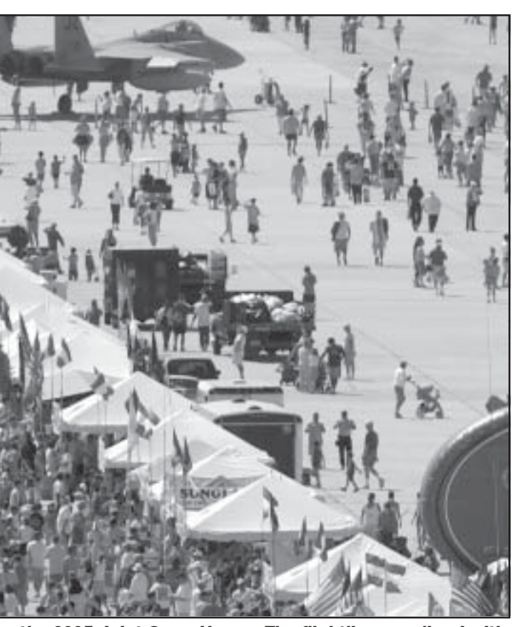
or the 2005 Joint Open House. The flightline was lined with ons. The air show ran from 11 a.m. to 4 p.m. Saturday and