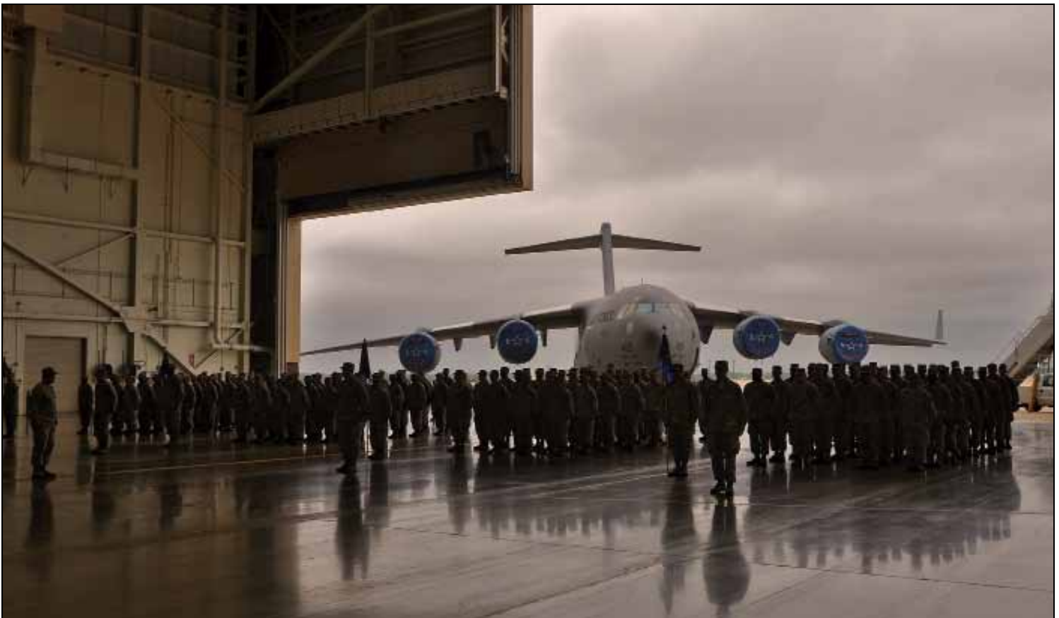
Flights of Airmen from the 514th Aircraft Maintenance Squadron, the 514th Maintenance Squadron, the 514th Maintenance Operations Squadron and the 714th Aircraft Maintenance Squadron stand at attention in formation during the ceremony.