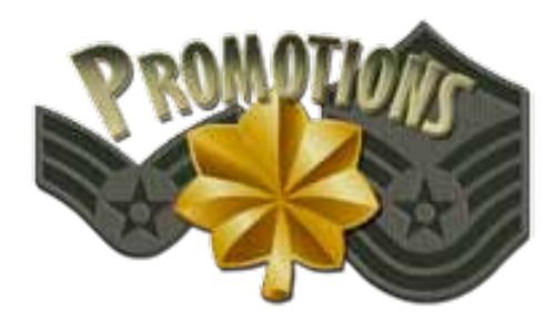
The following Airmen were promoted in June.

A C-17 Globemaster III flown by Airmen of the 732nd Airlift Squadron soars over the Washington Crossing Veterans Cemetery in Newtown, Pa., on Memorial Day. The squadron was recently named the winners of the Grover Loening Trophy, which recognizes the command's best flying unit. The squadron was selected because of its strong track record of volunteerism in support contingency operations around the world. The squadron's C-17 crews flew 653 operational sorties in 2,444 accident-free hours. They delivered 5,210 troops and passengers and 11,203 tons of critically needed war fighting supplies and equipment to operating bases in Southwest Asia and elsewhere in the world.