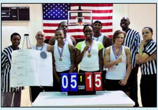
Members of the 514th Special Forces Squadron's basketball team pose for a photo after winning a wing tournament March 20.