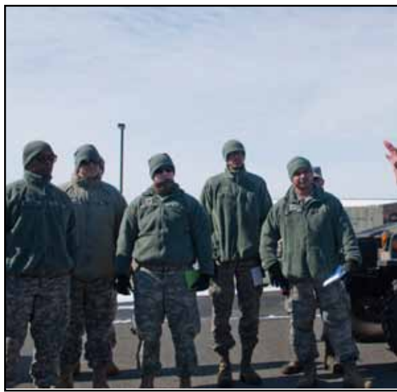
6 FREEDOM FLYER WWW.514AMW.AFRC.AE.MIL