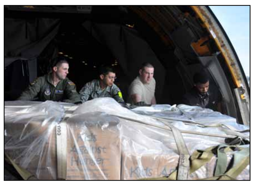
Crew members of the 76th Air Refueling Squadron secure cargo on a KC-10 Extender