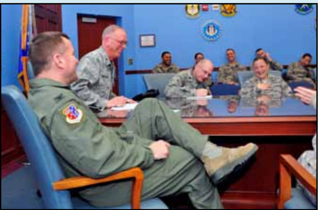
Wing staff share a laugh during a meeting in the command conference room March 7