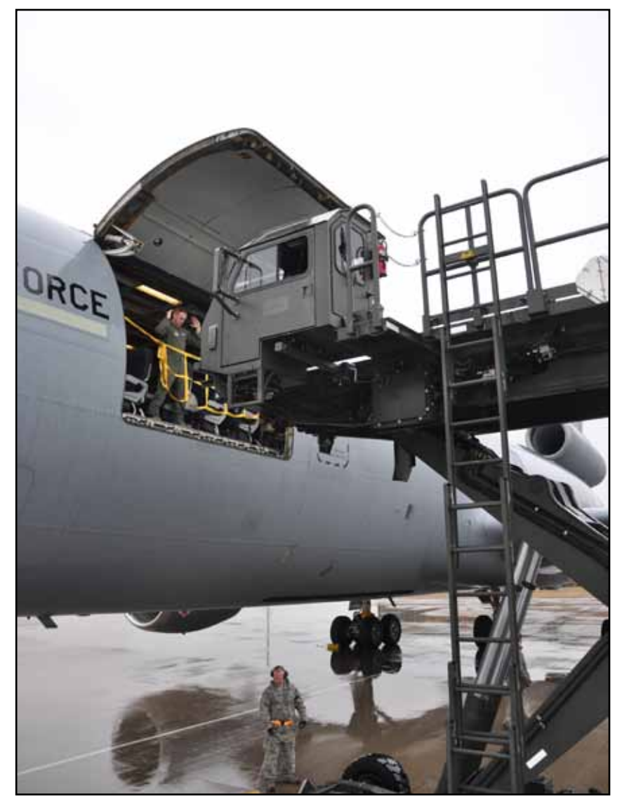
Crew members from the 76th Air Refueling Squadron load cargo onto a KC-10 Extender for a Denton Mission that is slated to reach Haiti.